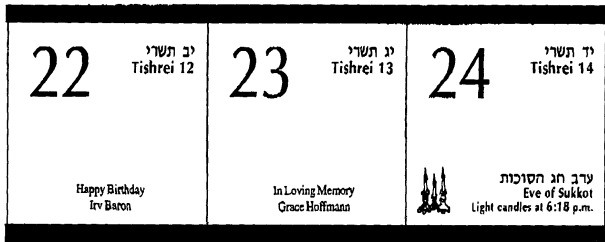
Sample calendar date space

Include business card, camera-ready ad or print the text of your message below. If necessary, type ad on a separate paper. For Anniversary, Birthdays, or Yahrtzeit, please include name of person & Hebrew or civil date of occasion.