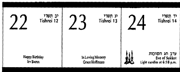
Sample calendar date space

Include business card, camera-ready ad or print the text of your message below. If necessary, type ad on a separate paper. For Anniversary, Birthdays, or Yahrtzeit, please include name of person & Hebrew or civil date of occasion.